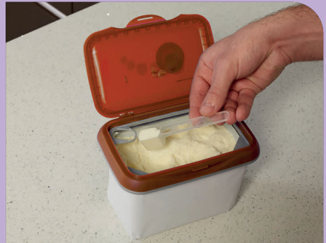
Infant formula powder or ready-to-feed liquid formula