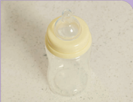
Bottles with teats and bottle covers

You need to make sure you clean and sterilise all equipment to prevent your baby from getting infections and stomach upsets. You'll need: