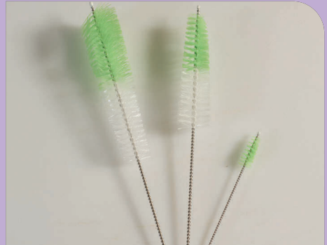
Bottle brush and teat brush