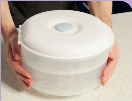
Sterilising equipment (such as a cold-water steriliser, microwave or steam steriliser)